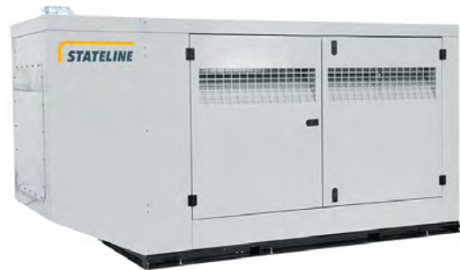
125-200 kW Models