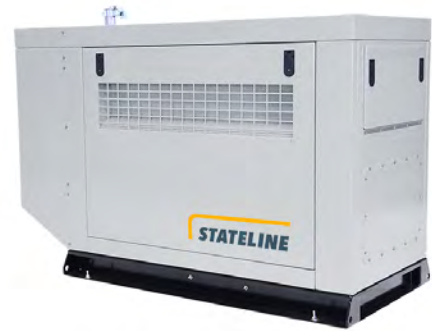
9-30 kW Models