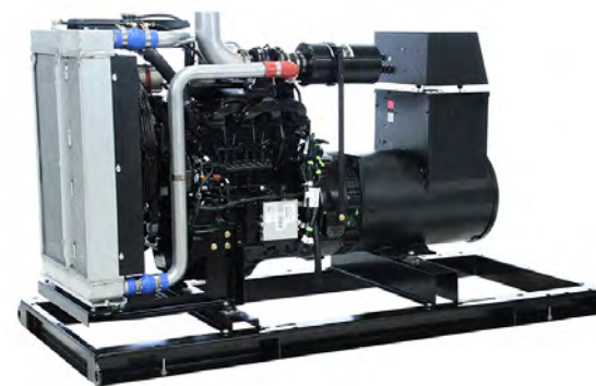
Product # SJ-100 100 kW Engine by John Deere