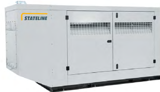
45-100 kW Models