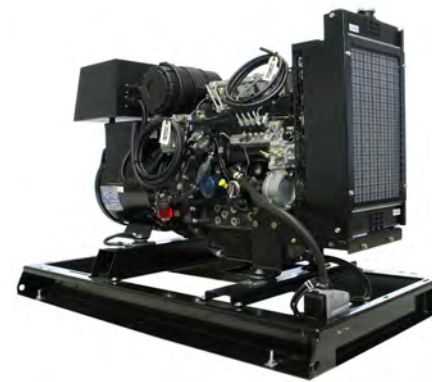
Product # SP-9 9 kW Engine by Perkins