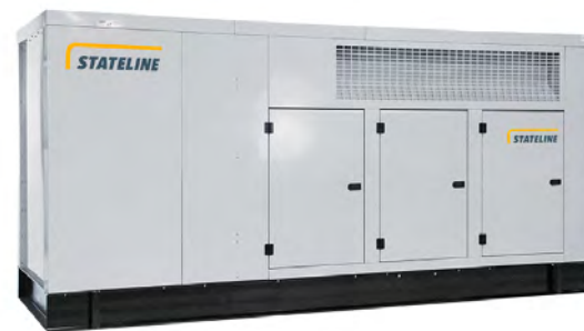
250 kW (+)